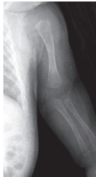
Figure 2 Left upper limb.