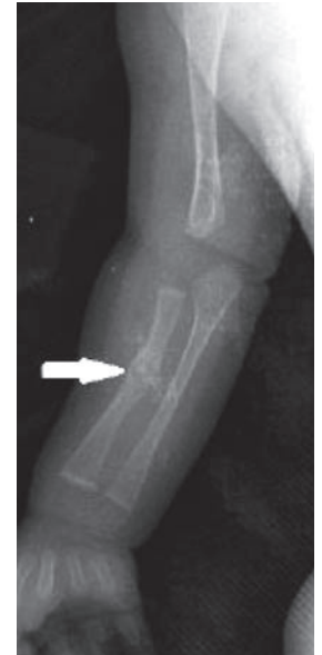
Figure 3 Right upper limb.