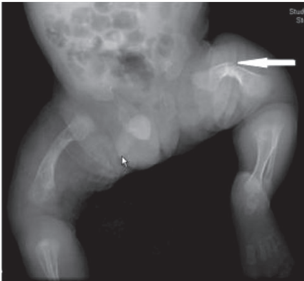
Figure 1 Lower limbs.

On Day 23, painful swelling was noted over the left thigh during routine nursing care. Examination showed white sclera. A skeletal survey was performed (Figures 1-4).