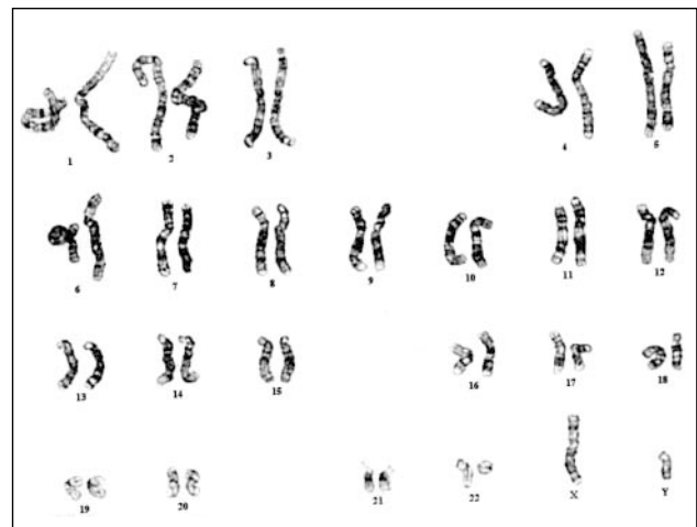
Figure 1 Karyotype of proband showing ring 22.

Ring chromosomes are formed as a result of breakage and reunion in the distal p and q arms with accompanying loss of genetic materials in these involved regions. In ring chromosome 22, loss of p-arm and satellite materials have minimal clinical consequences. Instead, the size of distal deleted q-arm segment affects the overall phenotype. There