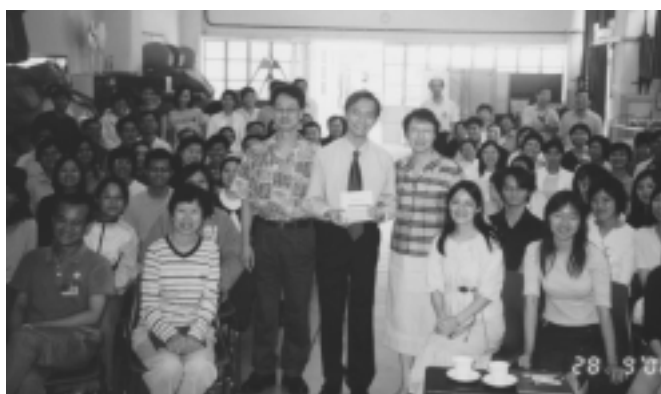
Figure 5 A blessing to share my experience.