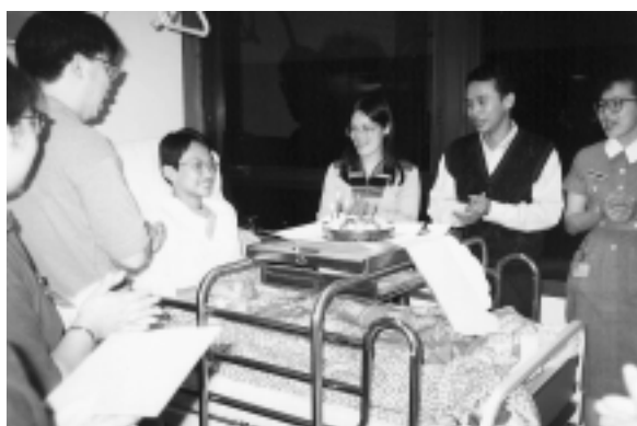
Figure 2 Birthday celebration with medical staff – the night before news-breaking.