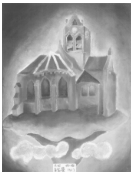
Figure 1 Breaking through the darkness – a drawing in Secondary 3.

movie, and dark sky at the corners of the picture, I mean when we are facing difficulties and challenges, we have to try our best to overcome, and persist in what we believe is true. Even though solving these problems may be as difficult as building a church in the laputa, without trying, we will not know we can actually break open the dark sky.