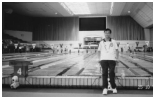
Figure 4 Participating in International Swimming Competition – overcoming physical disability.